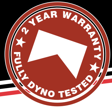
Caterpillar 3208 Turbo